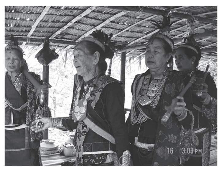
Plate 1 Lotud tantagas chanting during Mamahui Pogun ceremonies at Kg. Bantayan, Tamparuli

major catastrophes [Plate 1]. It proceeds over several weeks, moving from inland to the coast, features special gong ensemble music, ritual dancing and sacrifices by the tantagas , and involves the participation of all families in every Lotud village (Pugh-Kitingan & John Baptist 2009; Pugh-Kitingan et.al. 2009a, 2009b).