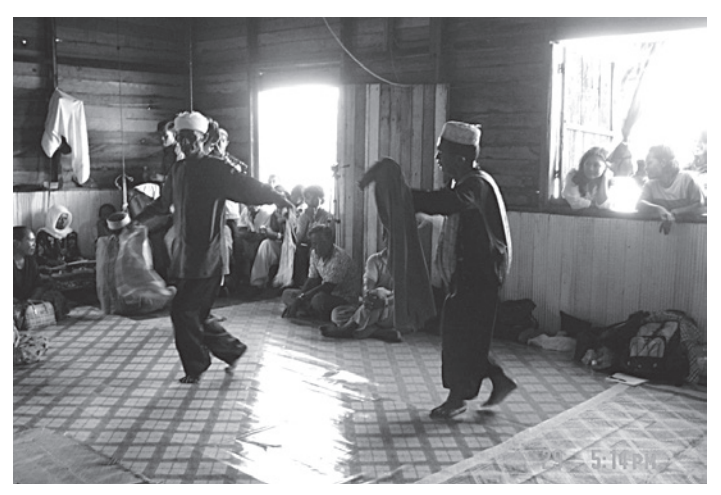
Plate 3 Igal by Bajau Kubang family spirit medium during Magduwata Kabusungan ceremonies at Kg. Kabimbangan, Bumbum Island

event among Kadazan Dusun of Tambunan (Pugh-Kitingan 2011: 168–171, 2012a: 119–130).