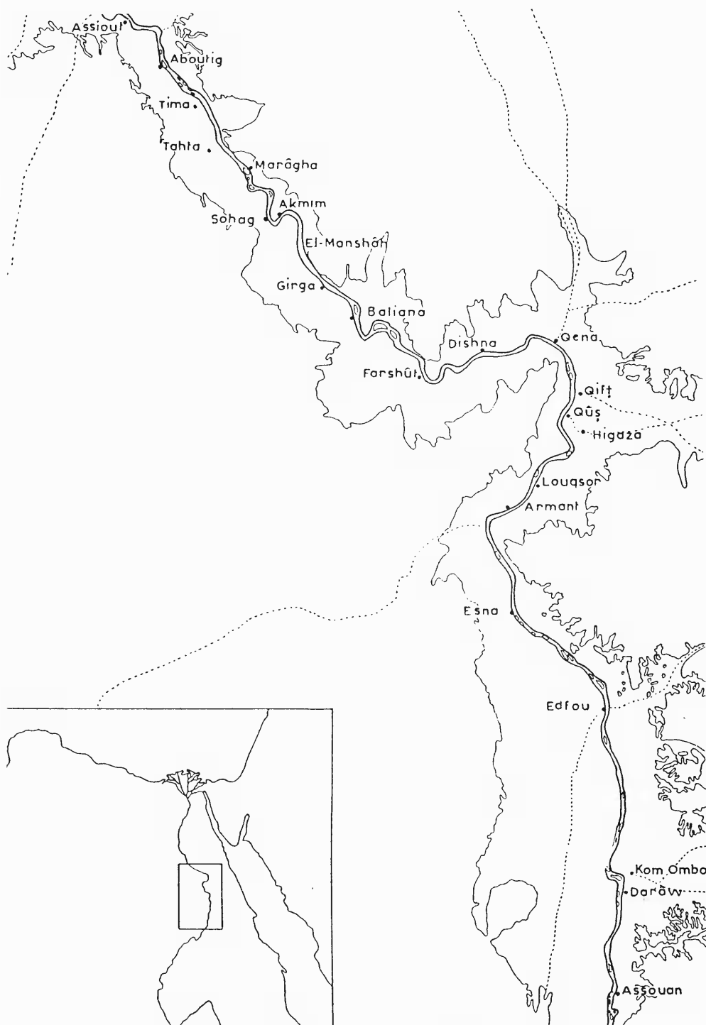
Map of Upper Egypt around Qift [arranged from J.-C. Garcin (1976)]